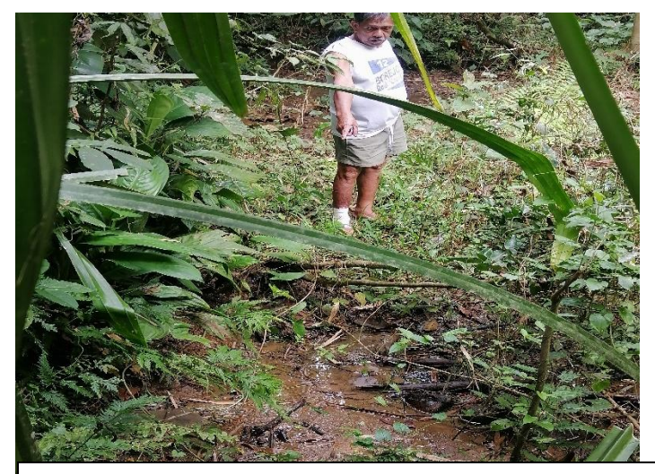
Land owner points the exact location where the concrete water tank should be putted at.